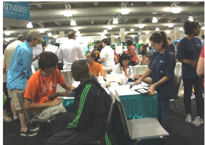
Volunteer students and MDs performing kidney health screening for June, 2011 Partner HealthCare / Channel 7 Health & Fitness Expo participants.

largest health event in Boston and was visited by just over 65,000 people in a weekend.