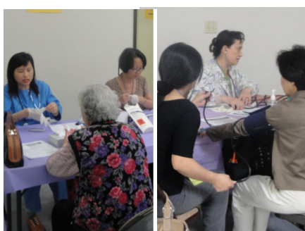
Nurses of FMLC measuring participants' blood sugar, left picture, and blood pressure, right picture.